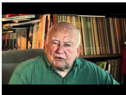
Ed Asner...a nuclear accident....