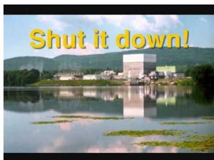
VY, unsafe today, shut tomorrow!