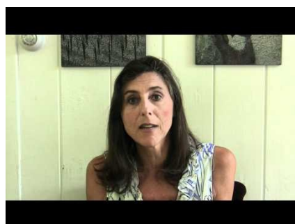
Votare si per dire no al nucleare!