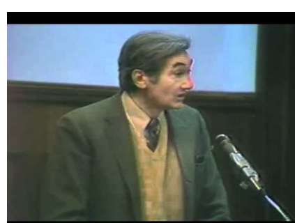
Howard Zinn, civil disobedience