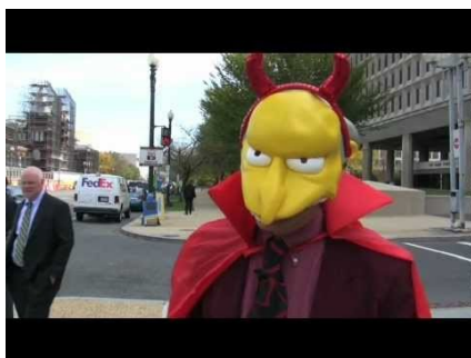
Halloween at DOE with Mr. Burns