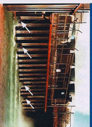
Water discharge area at a nuclear power plant on Lake Michigan. Note the flow from four big ejection outlets.

Radioactive gaseous and liquid releases to air, water and soil from nuclear power plants include: planned releases from the reactor's routine operation and unplanned releases from leaks and accidents.